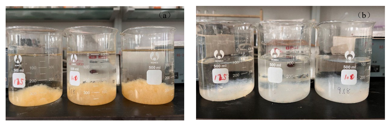
Figure 1 PAC defluorination (a), A12 (SO4)3 defluorination (b)

The flocs generated from PAC and aluminum sulfate experiments are shown in the following figure: