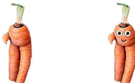
Fig. 1. a non-anthropomorphic image. b anthropomorphic image.

This article uses images and text to perform double anthropomorphic operations. Previous studies have shown that the dual design is more likely to stimulate the anthropomorphic perception of the subjects (Guido & Peluso, 2015; Puzakova et al., 2018; Huang Xin, 2018). In the selection of materials for this experiment, the screening criteria for product anthropomorphic images are mainly based on the research of Chen Tong et al. (2021), and finally selected natural unsightly carrots, a relatively common vegetable, as the product anthropomorphic The carrier of the image, anthropomorphic design of unattractive products. The two images of non-anthropomorphic and anthropomorphic are shown in Figure 1.