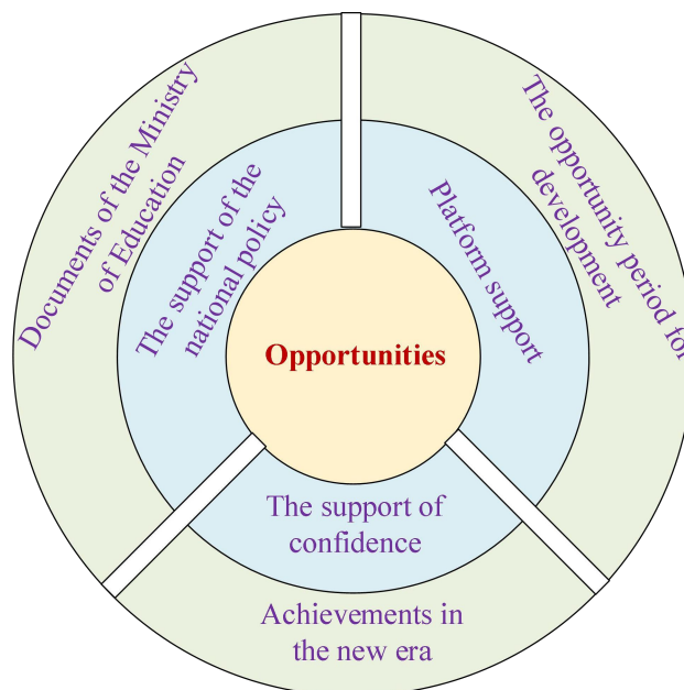
Fig 2. Analysis of the opportunity of the impact on Marxist faith education in the new era

opportunities of The Times and promote the in-depth development of Marxist faith education. Under the background of the new era, the opportunities of Marxist belief education are mainly reflected in that China is in a period of development opportunities. The state has issued relevant policies to ensure the construction of teachers to Marxist belief education, which enhances the confidence of education to Marxist faith to a large extent. The opportunity analysis architecture is shown in Fig2.