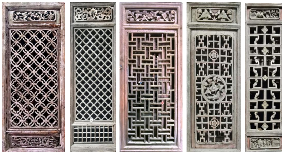
Figure 2. Examples of Hollow-out carving.