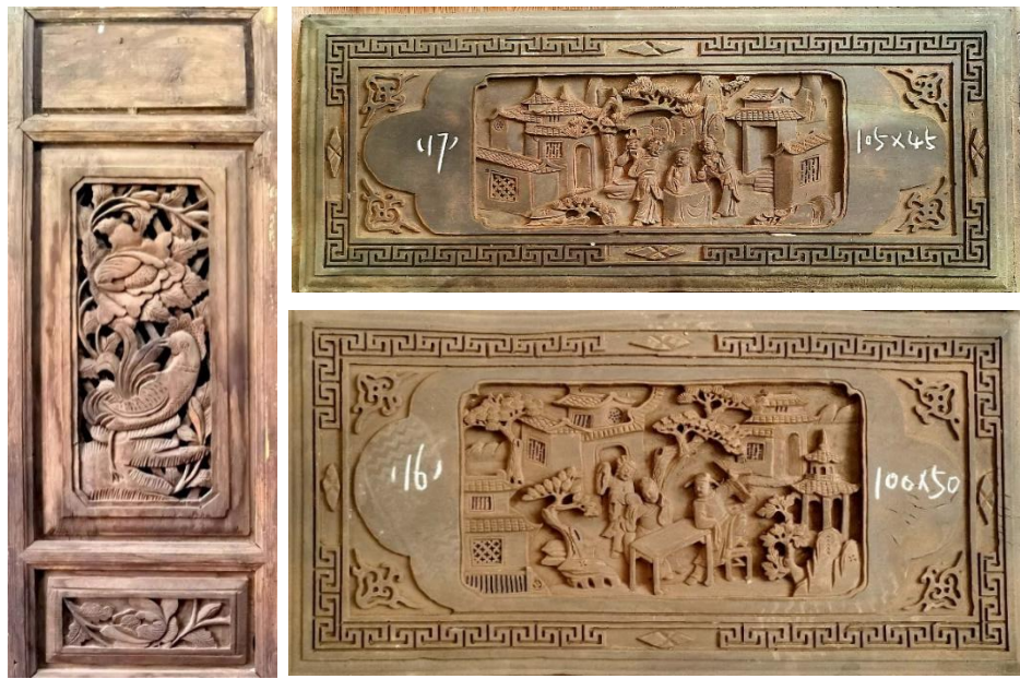
Figure 1. Examples of solid wood carving.