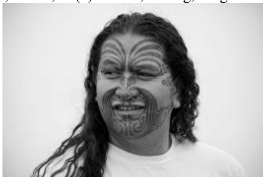
Fig. 2: Ta Moko, Maori tattooing on face.