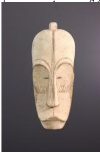
Fig. 1: Ngil's Fang Mask, Wood, 60(h)x20 cm, 1.95kg, Origin: ex-collection francaise.

Fortunately, as part of the Maori cultural renaissance in the late 20th century, Ta Moko reemerged in the public eye. In the 1984 exhibition "Te Maori: Maori art from New Zealand collections," Maori critic Hirini Moko Mead's comments shed light on the cultural suppression experienced by indigenous societies after colonization, a problem faced by indigenous people in New Zealand, Australia, and the Americas alike [7]. Their traditional ways of life were disrupted, natural resources and cultural treasures were plundered, property was confiscated, and cultural traditions were rewritten by the "conquerors." They were angry yet helpless [4].