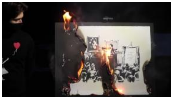
Fig. 4: The “Moron” was burnt in a video livestreamed from a park in New York

continuation of colonial narratives (as mentioned earlier, colonialism is an inevitable result of capitalist development).