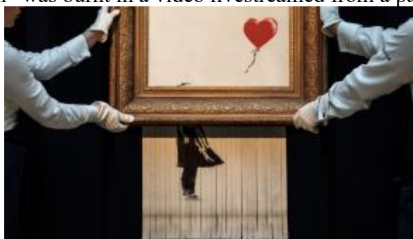
Fig. 5: Banksy's self-destructed work re-auctioned at Sotheby's London