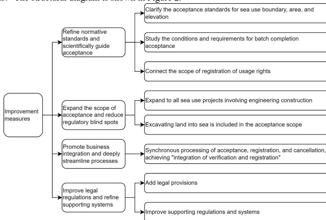
Fig.2 Structure diagram of improvement suggestions

Corresponding to the existing problems, provide improvement suggestions from the following aspects, The structural diagram is shown in Figure 2.